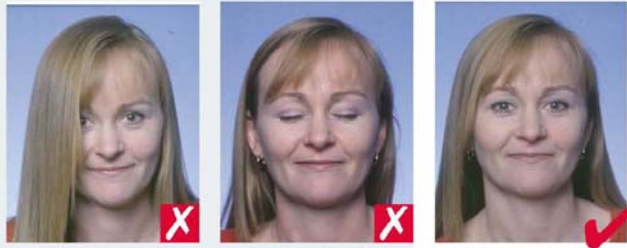
hair across eyes