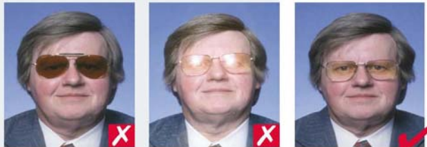
dark tinted lenses