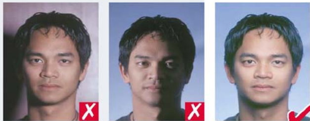
shadows behind head