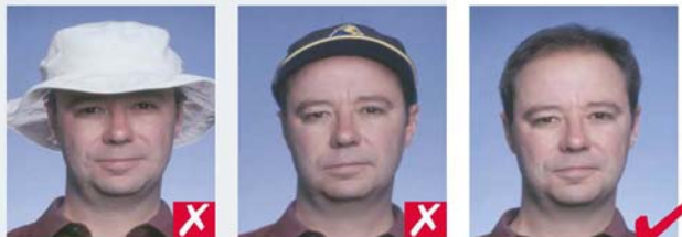
wearing a hat