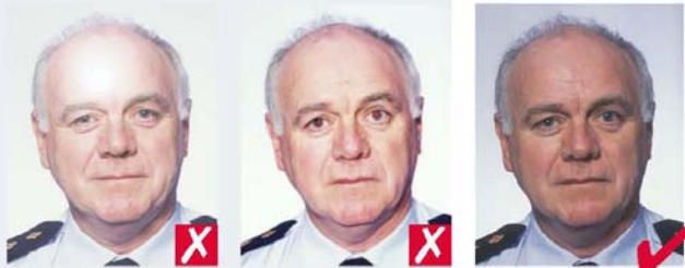
flash reflection on skin