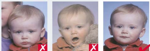
shows another person