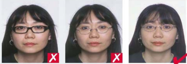
frames too heavy